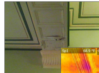
What YOU see...

We also have an ASNT-TC-1A certified thermographer on staff who can utilize infrared imaging technology as a non-invasive, non-destructive inspection process to gather temperature signatures that lie far beyond the range of visible light. Due to such a non-invasive method of inspection damage to the building is no longer an issue.